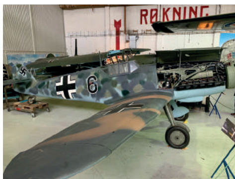
A restored ME109 at the Sola Historic Aircraft Museum

These events are just great fun and any UK member considering attending one of the weekends – don't hesitate and join in the next one!