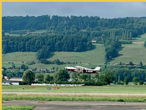
G-BOMP flying out of Bern on the way back

If you haven't been on one of these trips (Flying GA or commercial) you must next year!