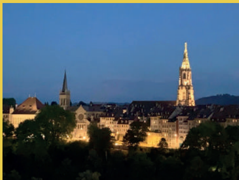
View of Bern at night from the hotel