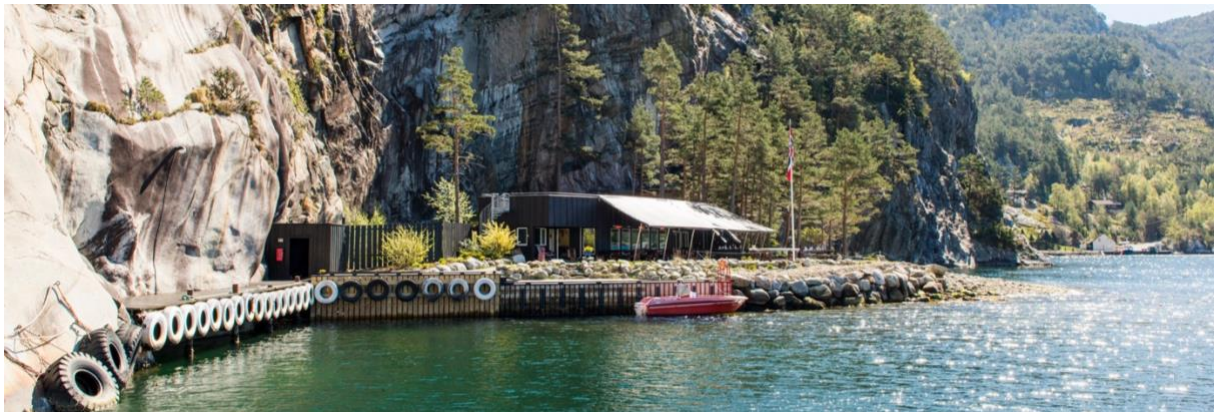
Restaurant Helleren in Lysefjorden

Then at 1600 we again meet in the hotel reception for a short walk to the electric boat Rygerelektra. The boat sails from downtown and will take us on a 3 hour cruise to Lysefjorden, you will see Fantahåla (Vagabond's Cave), the famous Preikestolen where Tom Cruise climbed the sheer mountain face in the movie Mission Impossible 6, and the towering Hengjanefossen waterfall. Then we will arrive the nice restaurant Helleren where it will be served a grill buffet. At 2200 the boat will depart for a 1 hour trip back to city centre.